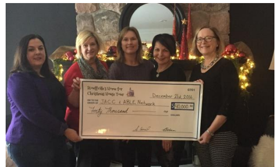
The cheque presentation.

We would like to send out a big thank you to all of the members of the “Stouffville’s Home for Christmas House Tour” committee. For the third year in a row, ABLE Network has been fortunate to be one of the beneficiaries of this fundraising initiative. This year $40 000.00 was raised. The ABLE Network and Jennifer Ashleigh Children’s Charity received $20 000.00 each! The ABLE Network has earmarked this money for our new Stouffville location which we hope to open in 2018. Thank you for all of your hard work!